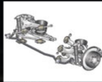
Double wishbone suspension