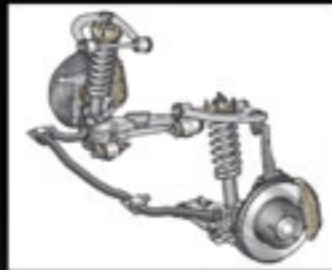
Double wishbone suspension