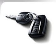
Keyless entry system