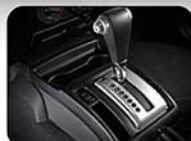
Inside door handle (chrome coated)/Door bezel