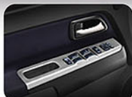
Automatic transmission shift knob