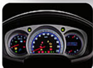
Electro-luminescent speed meter