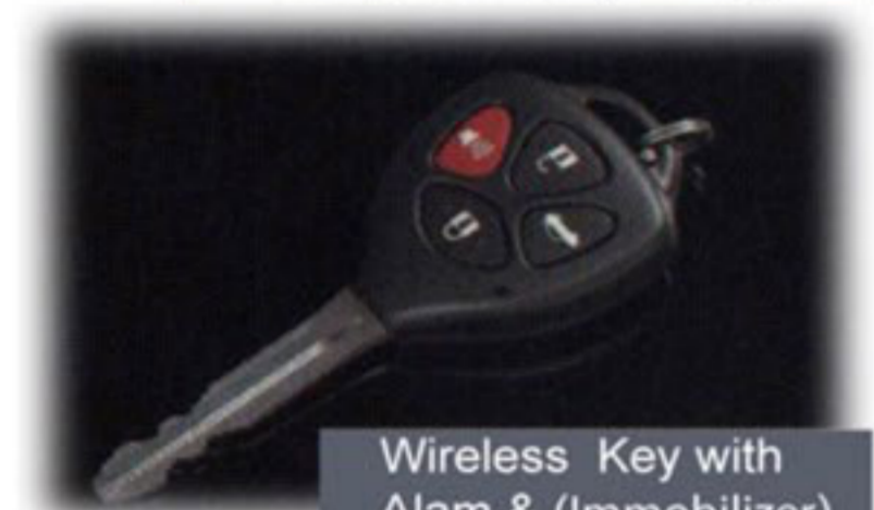
Wireless Key with Alam & (Immobilizer)