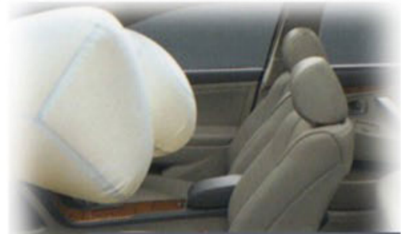
SRS(Dual Front) Airbags