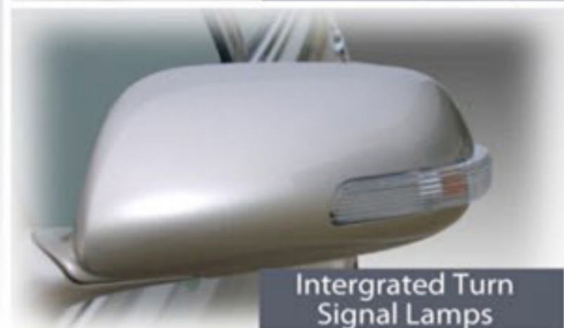
Intergrated Turn Signal Lamps