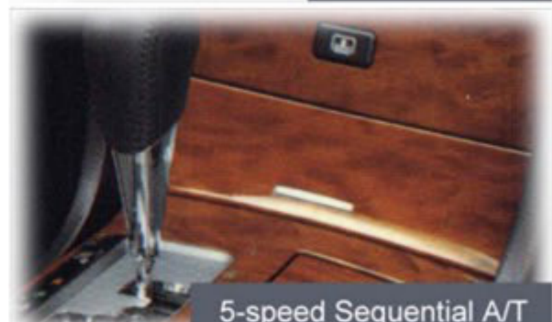
5-speed Sequential A/T