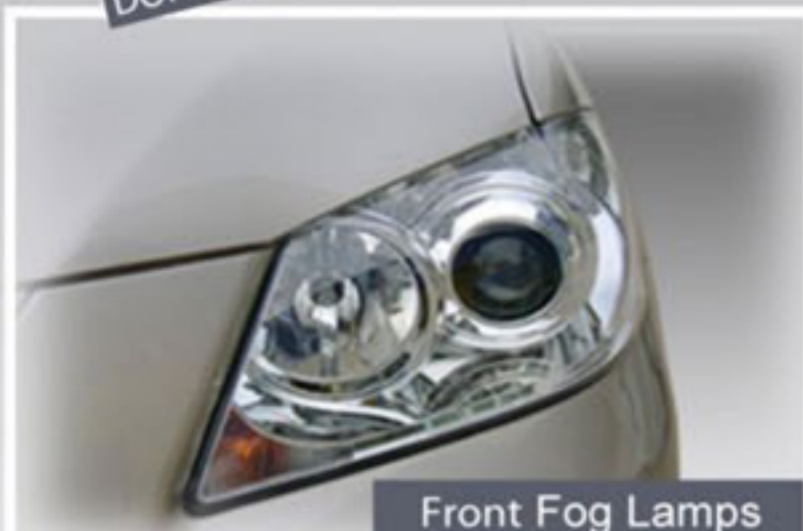
Front Fog Lamps