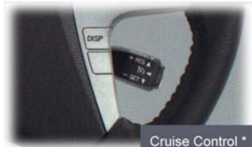
Cruise Control *